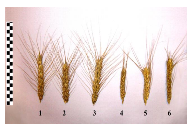
Fig. 1. Mutants according to Al'batros odes'kyi spike morphology: 1 – initial form; 2 – short spike; 3 – cylindrical spike; 4 – dense spike; 5,6 – square-headed spike

semi-awned spike; long, loose spike. Winter wheat Albatros odeskyi showed forms which could be characterized as high-grown, early ripening, with intensive growth, with short spike; high-grown, with long spike; shortgrown, late ripening, with light-green leaves and long spike; high-grown, with intensive growth, dense spike, antocyanin awns; high-grown, with short spike.