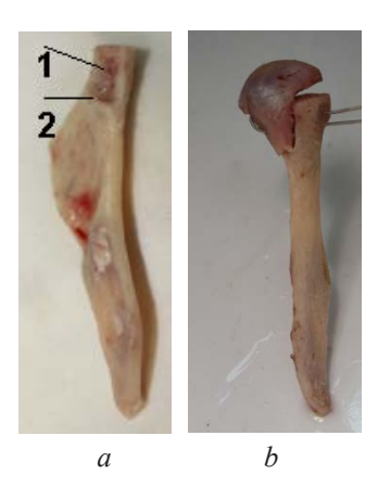
Fig. 3. Photos of osteotomized fragment of the patient's K. lower jaw branch: a – fragment of the lower jaw branch with formed area 1 and ledge 2; b – the head of lower jaw placed on the area and fixed with commissure

Postoperative period ran without any complications. The control examination and computed tomography were carried out in three month after surgery. There were not observed any functional disorders of the lower jaw and any displacements of splinters (Fig. 2, b ).