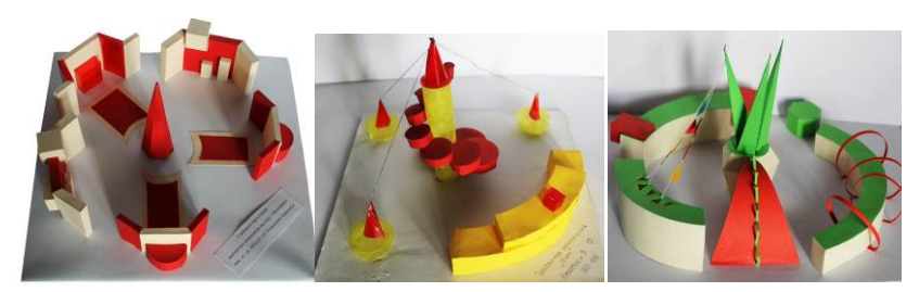
Fig.10. Spatial composition of concept formalization: "nature", "holiday". Students' works: Kovalenko A., Kekkonen R., Polishchuk A.

It was suggested to resolve an abstract composition in terms of associative spatial composition using one of the spatial composition types, namely axial, centric, and polycentric. Especially useful exercise for students of "Interior Design" specialization is a thematic angular composition with partially limited space (Fig.11).