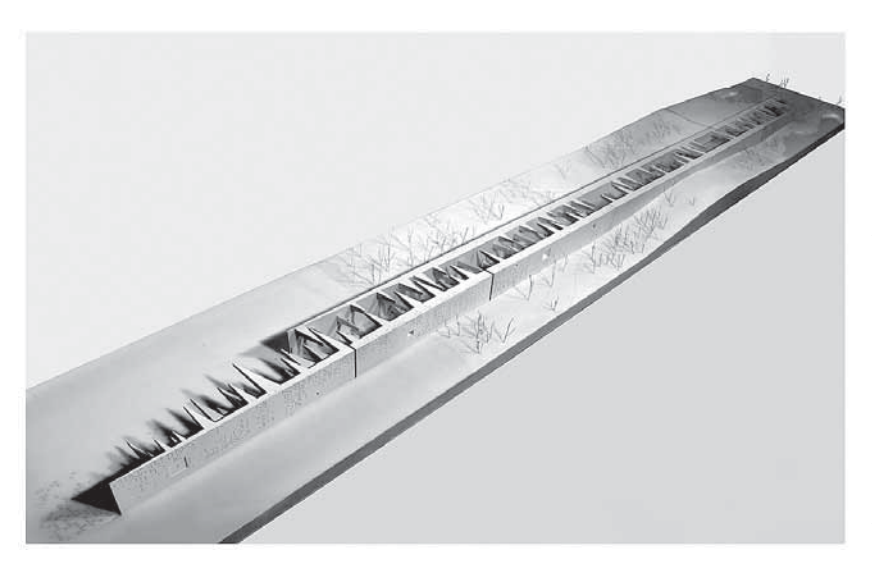
Fig.3. City of pain - purgatory project architectural expression.

describes a different segment of the project. The concept of the city can be treated in two ways: as an urbanised part of antropogenic environment, or, in this case, as a concentration of necessary functional knots in one point (Fig.3). The title of city of pain defines a new functional type of the building created in the experimental project. A module of hospital - pain clinic is multiplied and designed into the city-inside-the city structure, considering a large volume of New York scale. The manifest of this model of experimental type is an integrational laboratory in an ordinary recreational surrounding. A megastructure is offered, i.e. the city with its own system for providing service and allowing existence, somewhat limiting itself from the external world visually. The aim of the research is to create a stable autonomous polar point, the place of attraction for incurable patients, without retracting them from the city's social and physical structure.