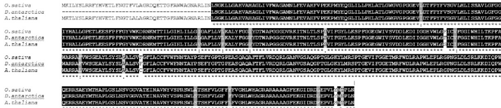
Fig. 2. Comparison of amino acid sequences of PS II protein fractions of D. antarctica , A. thaliana and O. sativa .

Multiple global alignment of found sequences of A. thaliana and O. sativa with fragment has revealed the significant level of conservatism of this proteins (fig. 2).