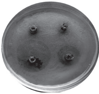
Fig. 1. Method of cylinders.