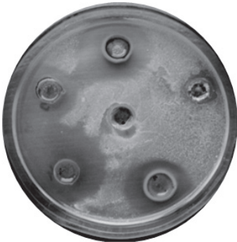
Fig. 2. Method of cup plates.