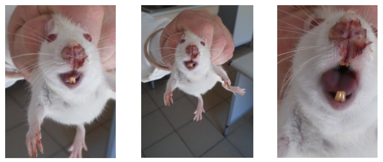
Fig. 2. Clinical manifestations of fumonisin toxicosis in rats of II, III, IV groups, formation of crust and hyperemia of visible mucous membranes