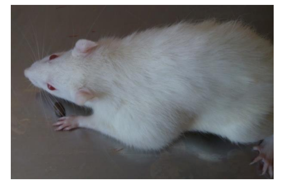
Fig. 3. Manifestations of toxicosis in rats, edema in joints in animals of II, III, IV groups

After the pathologic-anatomical section of the dead animals, hemorrhages of the thoracic muscles were detected. The obtained observation results during the experimental period are given in Table. 1