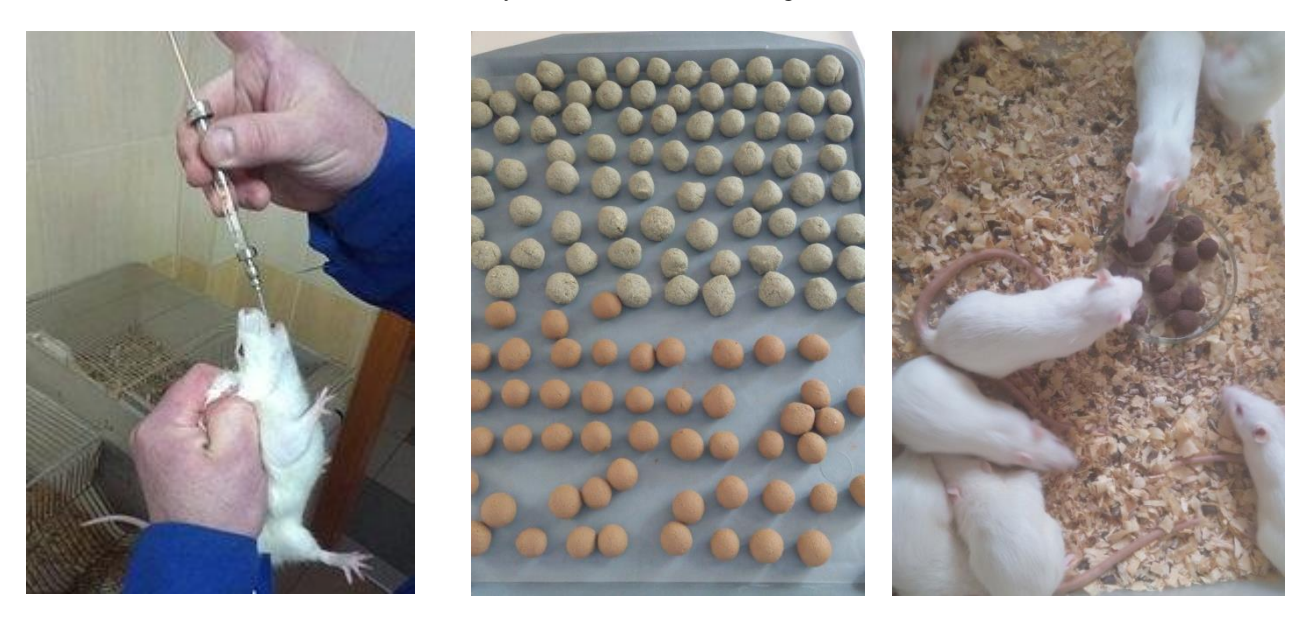
Fig. 1. Rat. Toxin introduction in II, III, IV - groups. Preparation and Feeding of Feed Additives HammecoTox and Zeolite

During the experiment, observations were made of the behavior of animals, their clinical condition and death were shown. At the 14th and 21st day of the experiment rat were weighing and blood was collected for hematological, immunological and biochemical studies, by decapitation, under a slight, etheric anesthetic, following the position of the European Convention for the Protection of Vertebrate Animals, which are used in experiments and other scientific purposes (Strasbourg, 1986).