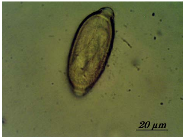
Fig. 2. Egg nematodes of the species Aonchotheca bovis of the control culture with the formed larvae at day 27 of the experiment

At the same time, in the control culture, in 79.0% of eggs of capillaries, until the end of the experiment, the formed larva (Fig. 2), which was actively moving under the influence of heat on it, was detected.