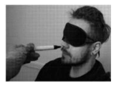
Fig. 2 – Sniffin' Sticks methods in progress [5]

Data collected on the USA population showed that participants' score out of forty was dependent on gender, age and smoking status. A diagnostic ladder was drawn up and six categories devised for olfactory diagnosis depending on score [6]. This test is occasionally judged to have an American cultural bias. There have British, Chinese, French, German, Italian, Korean and Spanish UPSIT versions made. There are called the Brief (Cross-Cultural) Smell Identification Test. It evaluates olfactory functions uses 12 odor capsules that are familiar with people from other cultures [3]. The advantages of the test are: reliability, low cost, ease of use, the possibility of testing in all conditions, even the self-test at home or in the field.