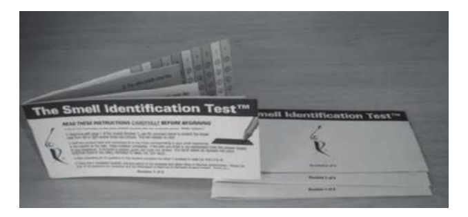
Fig. 3 – University of Pennsylvania Smell Identification Test (UPSIT) [6]

Data collected on the USA population showed that participants' score out of forty was dependent on gender, age and smoking status. A diagnostic ladder was drawn up and six categories devised for olfactory diagnosis depending on score [6]. This test is occasionally judged to have an American cultural bias. There have British, Chinese, French, German, Italian, Korean and Spanish UPSIT versions made. There are called the Brief (Cross-Cultural) Smell Identification Test. It evaluates olfactory functions uses 12 odor capsules that are familiar with people from other cultures [3]. The advantages of the test are: reliability, low cost, ease of use, the possibility of testing in all conditions, even the self-test at home or in the field.