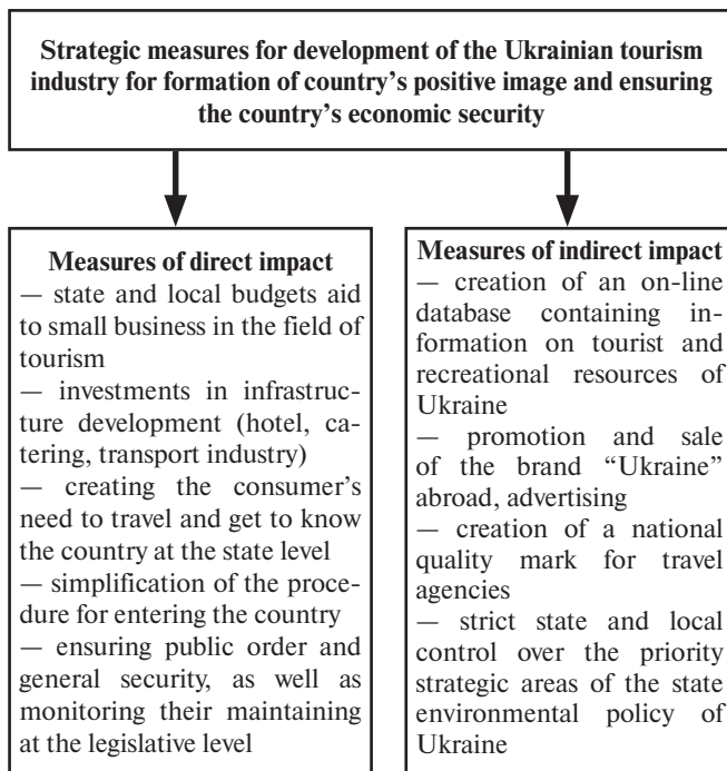
Fig. 2. Strategic measures for development of the Ukrainian tourism industry for ensuring the country's economic security

the expense of special funds, through targeted budget financing on the basis of non-repayable subsidization, celebration of contracts for the development of tourism projects, including green tourism, taking into account reconstruction of cultural and architectural monuments. This will bring the level of tourist infrastructure in line with international standards.