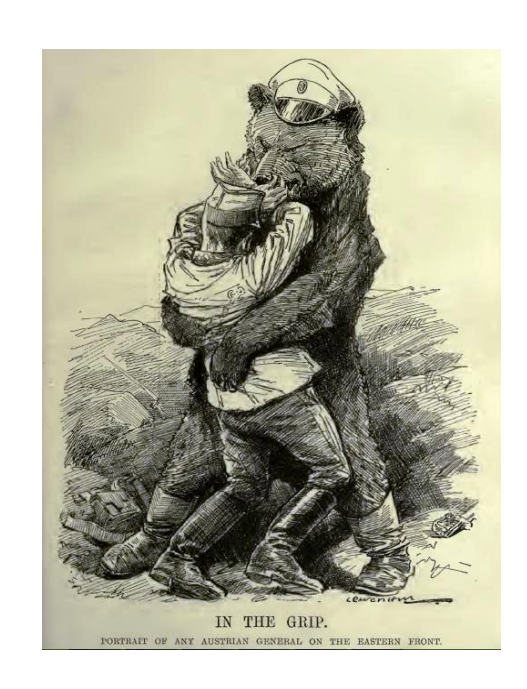
Fig 1. Punch. 1914. Vol. 147. August 26. P. 177. Fig 2. Punch. 1916. Vol. 151. August 11. P. 135.