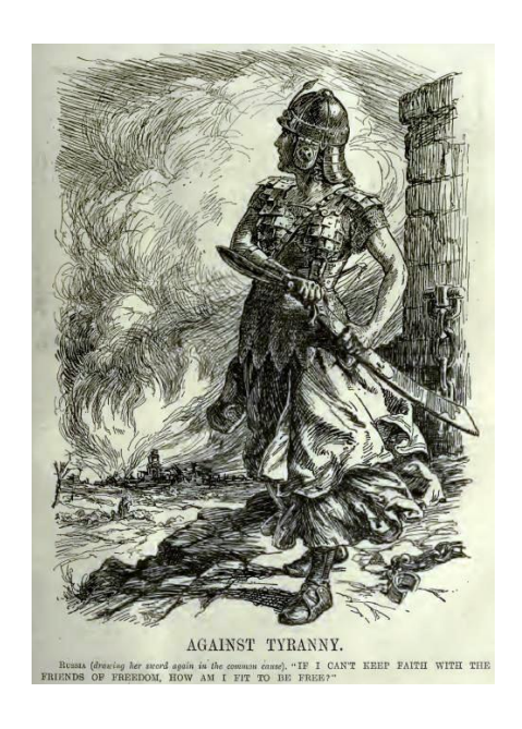
Fig 3. Punch. 1917. Vol. 152. June 6. P. 369.