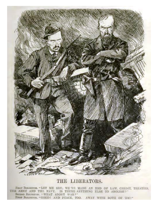
Fig 5. Punch. 1918. Vol. 154. February 20. P. 155. Fig 6. Punch. 1917. Vol. 153. December 12. P. 399.