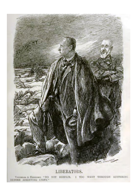
Fig 4. Punch. 1917. Vol. 153. September 5. P. 175.