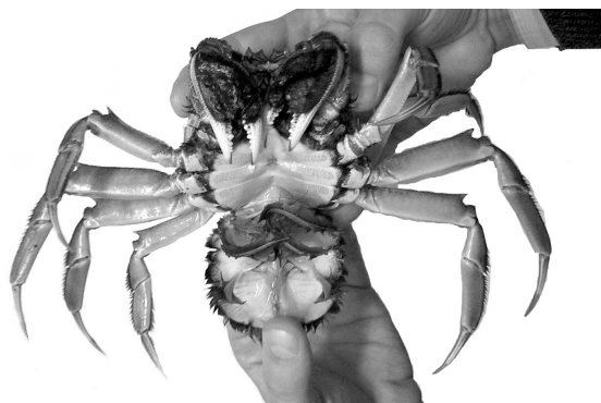
Fig. 2. Chinese mitten crab, Eriocheir sinensis , from the Dneprovskoye Reservoir. Рис. 2. Китайский мохнаторукий краб, Eriocheir sinensis , из Днепровского водохранилища.

Giant prawns of the genus Macrobrachium are a key element of modern freshwater aquaculture. In the former USSR, experimental cultivation of M. nipponense and M. rosenbergii (De Man, 1879) was organized in natural and warm-water reservoirs before 1970s (Suprunovich, Makarov, 1990). In 1986, M. nipponense was introduced into the Kuchurgan Liman (cooler reservoir of the Moldavian Hydro-power Station), waterbody on the Transdnistrian stretch on the border between Ukraine and Moldova Republic (Makarov, 2004). M. rosenbergii has been cultivated in the closed reservoirs of the Crimean