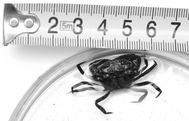
Fig. 3. Harris mud crab, Rhithropanopeus harrisii , from the Dneprovskoye Reservoir.

Рис. 3. Голландский краб, Rhithropanopeus harrisii , из Днепровского водохранилища.