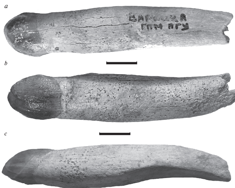
Fig. 2. Odontoceti indet., GPMTSU 2–01/1: a — lingual view; b — buccal view; c — anterior or posterior view. Scale bars 1 cm.

GPMTSU 5–02, a large conical single-rooted tooth with a proximally widening root (reconstructed as banana-shaped) covered by a thick cement layer, is identical in shape and structure to mandibular teeth of physeteroids, and thus we identify it as a lower physeteroid tooth. The tooth GPMTSU 5–01 differs from known physeteroid lower teeth in its straightness and a crown at least as wide as the root, so we identify it as an upper tooth. There is no strict proof that GPMTSU 5–01 and GPMTSU 5–02 belong to the same individual or the same taxon. However, they were found together, their state of preservation is identical, their wear patterns are similar, and the hypothetical trace of occlusal wear indicates the presence of both upper and lower teeth. Thus, we identify GPMTSU 5–01 and GPMTSU 5–02 as belonging to the same taxon, Physeteroidea indet. GPMTSU 5–01 and GPMTSU 5–02 differ from Physeteridae sensu Lambert et