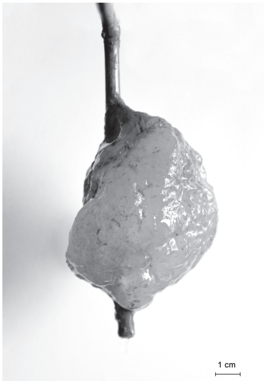
Fig. 3. General view of the colony of bryozoan Pectinatella magnifica on the reed stem from the Ukrainian part of the Danube Delta.

spinoblast features (Gontar, 2012 b). The spinoblast of P. magnifica resembles those of the Cristatellidae, such as Cristatella mucedo Cuvier, 1798. The two species can be distinguished by the anchor-like thorns occurring in two sets of rows, with 12–20 dorsal thorns and 20–40 occurring ventrally in C. mucedo (Waaij van der, 2013). P. magnifica has a single row of 11–21 thorns with a mean number of thirteen (Davenport, 1900) (fig. 2). Both species have similar statoblast shapes; the colonies of C. mucedo are relatively small, up to one centimeter, whereas P. magnifica can be up to 40 cm in extent and has a different anatomy (Gontar, 2012 b).