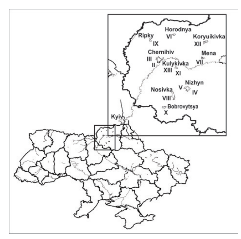
Fig. 1. Region of investigations.