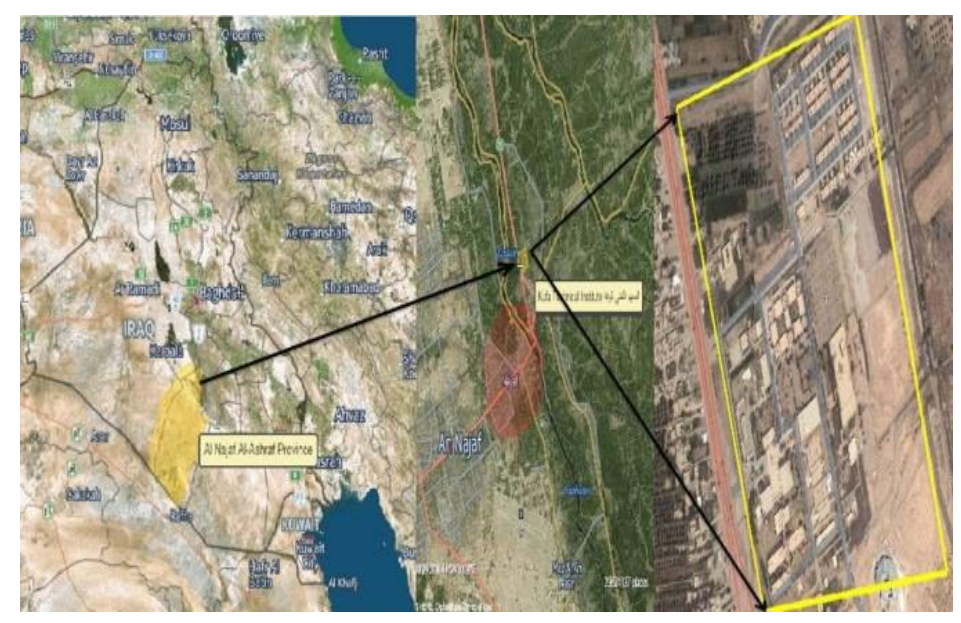
Fig. 1. Location of Kufa Technical Institute.

The Technical Institute of Kufa was established in 1980 at a location of (32^{\circ}3'34''N) latitude and (44^{\circ}24'18''E) longitude with a total area of 268035m^{2}[11] as seen in Fig. 1.