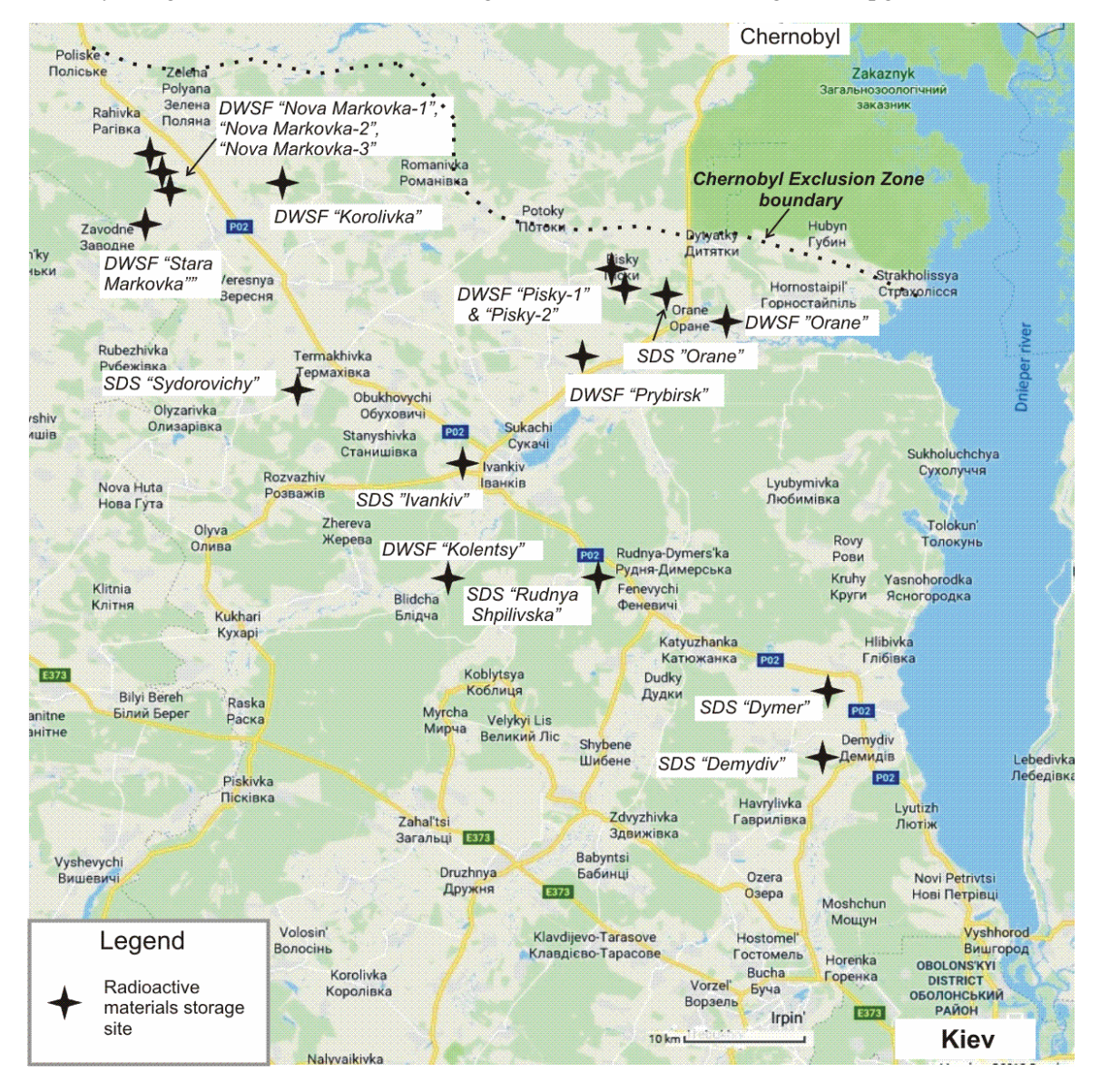
Fig. 2. Map of the studied Chernobyl radioactive legacy sites in Kyiv region.