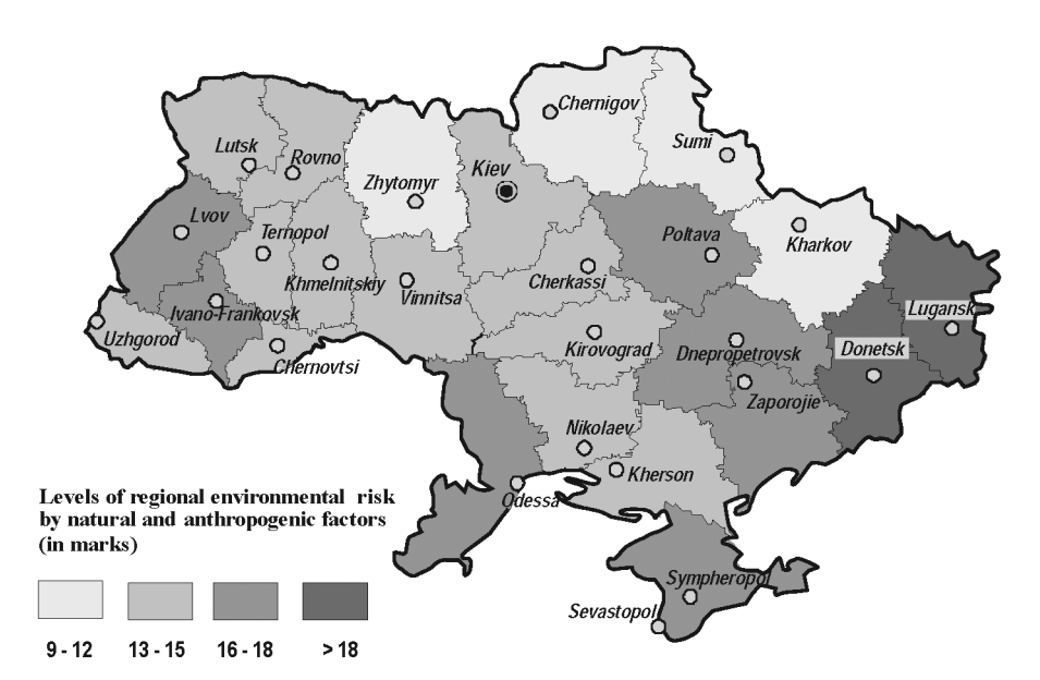
Fig. 1. The scheme of complex regional environmental risk of Ukraine [5]

tion cases (well drilling and sampling) is rather expensive and can promote oil spreading in the subsurface. The attempt to use a geophysical surface method based on measurements of electromagnetic conductivity failed to provide correct results. Contaminated plumes revealed by this method within Uzin military airbase in Kiev region did not correspond to the map made by well drilling and sampling [4]. However, we concluded that mapping and monitoring can be sped up measuring hydrocarbon concentrations in samples near a well in situ. For this a portable chromatograph (less 5 kg) can be used to measure hydrocarbon contents in water, soil and air for one minute. Such an apparatus developed on basis of a flameionization detector was tested.